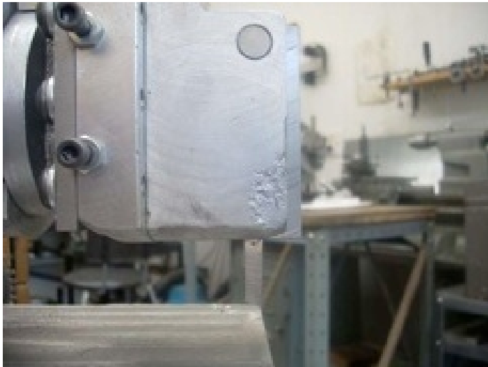
Cutter Forward Travel

One of the challenges of modifying Gingery's shaper design is that there are unexpected consequences. One of these surprises was that the cutter did not reach far enough forward. It also started too far back.