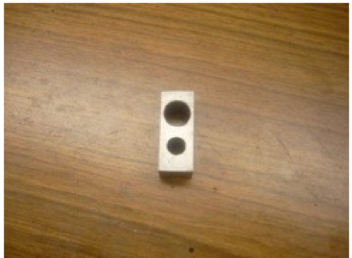
Ram Clamp

That should have helped but now the clamp guide is hitting.