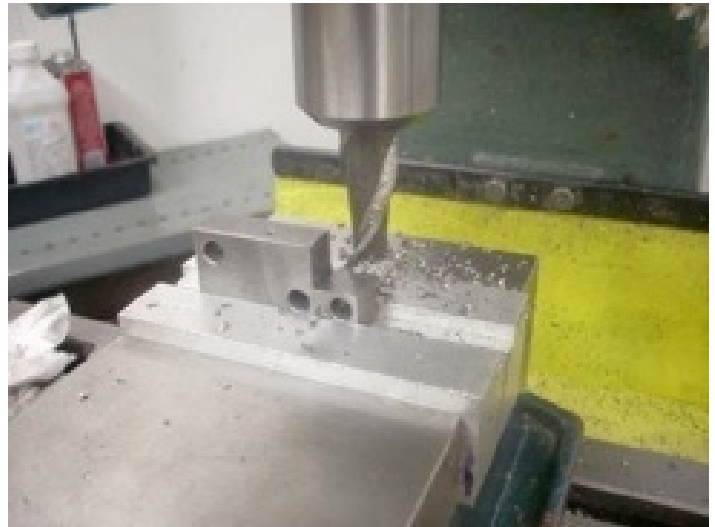
Link Block Modification 1

The trick in making any adjustment is to minimize rework of parts.