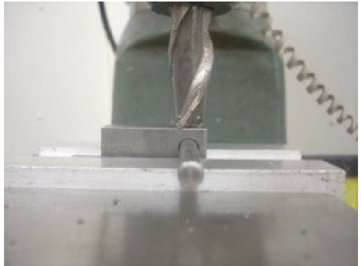
Milling Corner

I also had to recut the clamp guide so the larger hole was open on the end facing the link. That got me another 0.2".