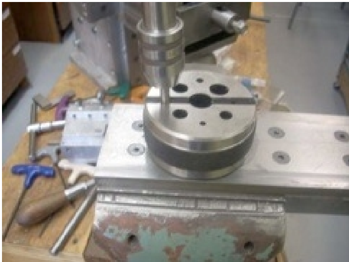
Ram Way Modification

The large hole passes the ram clamp while the smaller hole is for a screw that fastens it to the bottom of the ram (see page 67 of Gingery's book). By just removing the screw and rotating the block, I was able to gain more than 1/2".