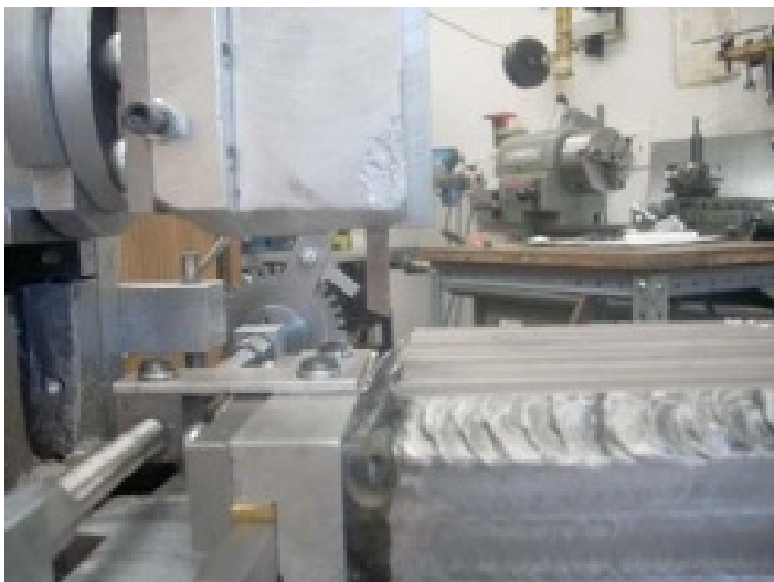
Cutter Rear Travel

After making a few modifications, I was able to get the cutter to almost reach the front edge of the table. At the start of the stroke it now just comes off the table.