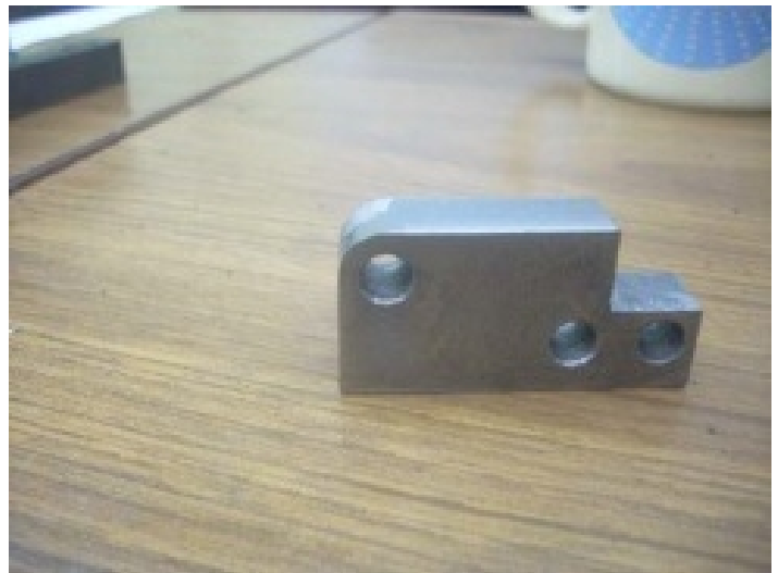
Link Block Done

The block was then rotated so the top right corner points straight up. I milled it down until the DRO read zero.