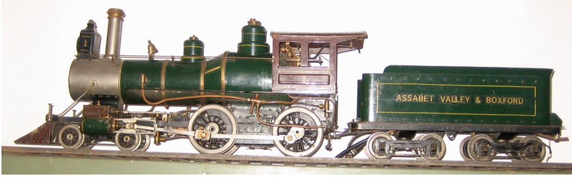
Locomotive Number 1 (Virginia) and Tender

Description : Coal burning model, 1inch scale, 4 <sup>3</sup>/<sub>4</sub> inch gauge, 0-6-0 wheel arrangement, operates at 80 – 100 PSI. British "Pannier Tank" used for light passenger and freight hauling, a member of the British Great Western Railway 5700 Class locomotive. Built by Walter M. Bush in 1971 – 1975.