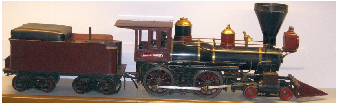
Governor Stanford and Tender

Below are the two new display cases in which Walter Bush's locomotives are now on display and descriptions of their contents. Also on display are two artifacts of unknown origin – A "Nickel Plate" (New York, Chicago & St. Louis Railroad, commonly known as the Nickel Plate Road (NKP) locomotive and tender and a red caboose. Any information on these will be greatly appreciated.