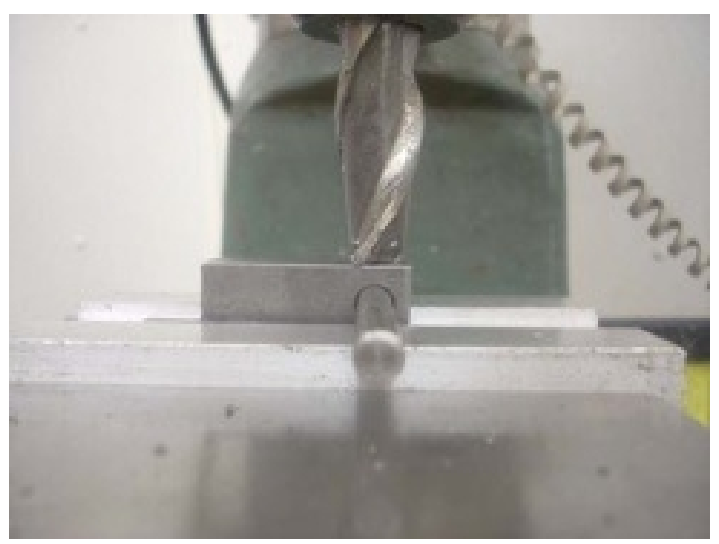
Milling Corner

I also had to recut the clamp guide so the larger hole was open on the end facing the link. That got me another 0.2".