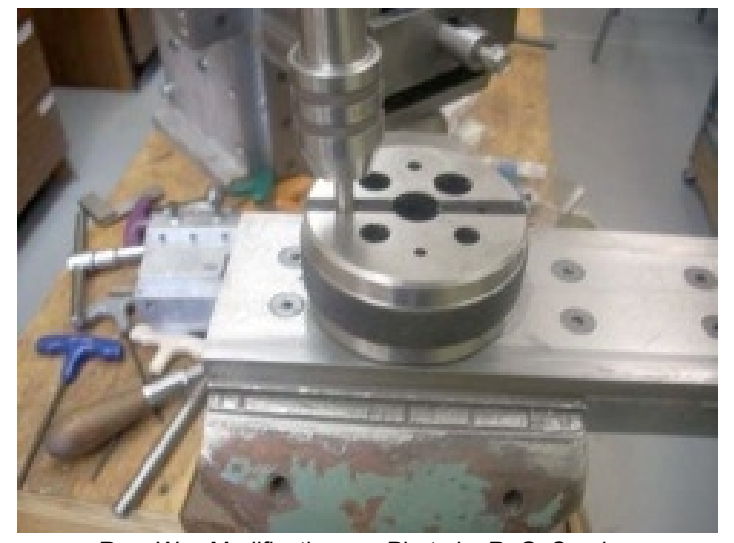
Ram Way Modification Here I am using a bench block to tap a new hole in the ram ways for the clamp guide screw.

The large hole passes the ram clamp while the smaller hole is for a screw that fastens it to the bottom of the ram (see page 67 of Gingery's book). By just removing the screw and rotating the block, I was able to gain more than ½".