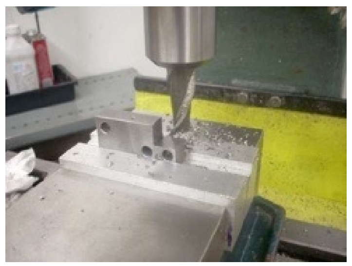
Link Block Modification 1 One point of interference is the link to the ramp clamp. Here I am cutting a step so the ram clamp can have a bit more room.

The trick in making any adjustment is to minimize rework of parts.