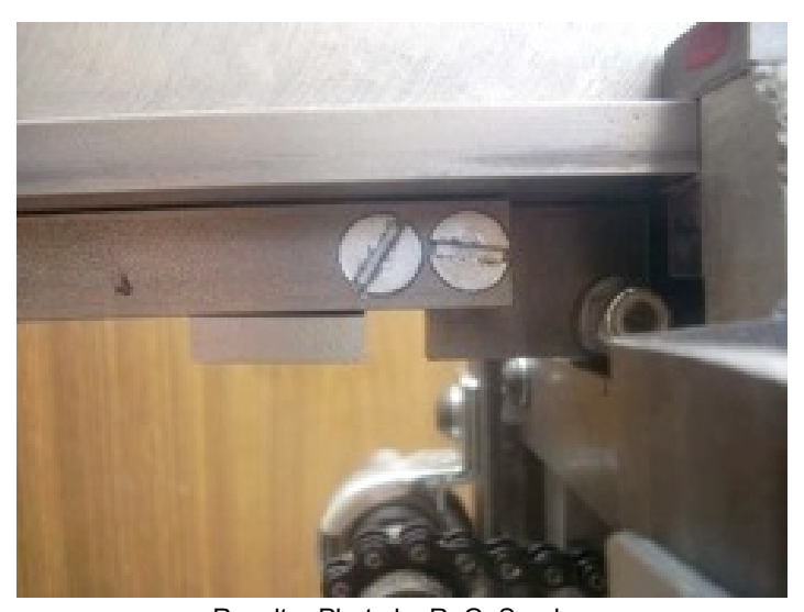
Result That should have helped but now the clamp guide is