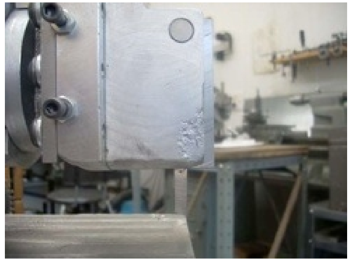
Cutter Forward Travel

One of the challenges of modifying Gingery's shaper design is that there are unexpected consequences. One of these surprises was that the cutter did not reach far enough forward. It also started too far back.