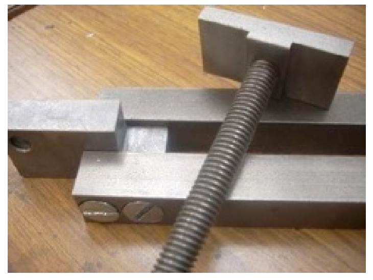
Link Block Modification 2 I had to recut the link block so that the raised part of the clamp would slide over the link.

I also had to recut the clamp guide so the larger hole was open on the end facing the link. That got me another 0.2".