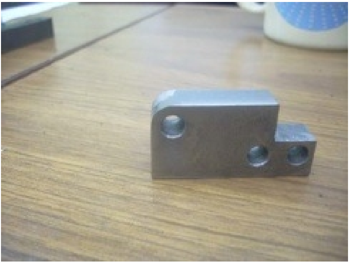
Link Block Done

The block was then rotated so the top right corner points straight up. I milled it down until the DRO read zero.