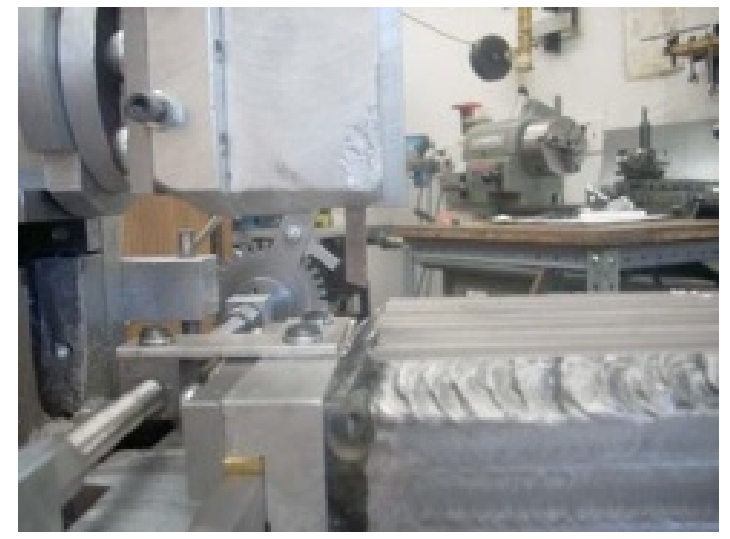
Cutter Rear Travel

After making a few modifications, I was able to get the cutter to almost reach the front edge of the table. At the start of the stroke it now just comes off the table.