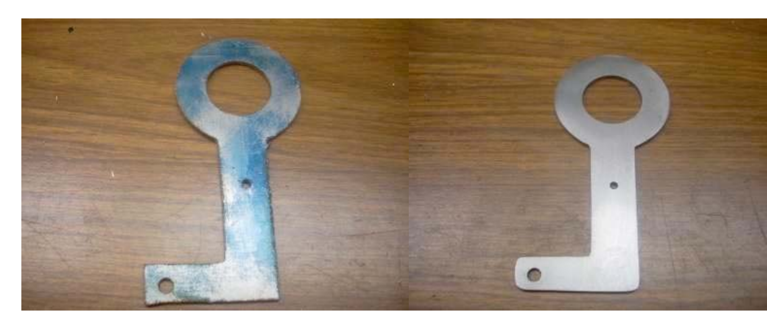
Ratchet Plate Rough Cut

Above is the ratchet plate before cleaning up the edges. You can see that my eye was a bit off on the lower edge. The ^3/_{16} " hole is not centered.