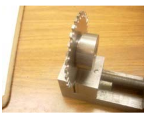
Ratchet Wheel Side View

I put a close fitting ^3/_8 " rod into the hole and then secured the two screws. Thanks to match drilling, it fits together precisely