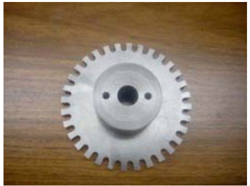
Match Drilled Holes