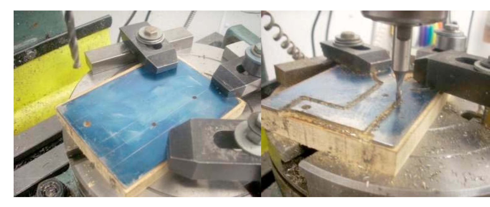
Plate on Rotary Table

The round part of the ratchet plate was centered on the rotary table. All three holes were drilled next.