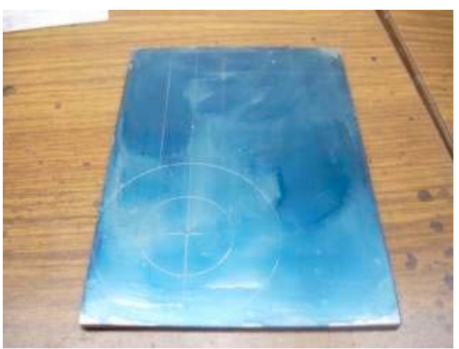
Ratchet Plate Markup

You can see the 1" diameter 0.076" wide slot that will take the ratchet plate.