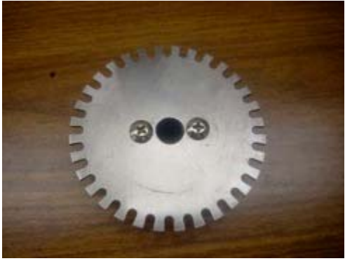
Hub Secured to Wheel

Not shown here is that I put a close fitting ^3/_8 " rod through both the hub and ratchet wheel before match drilling.