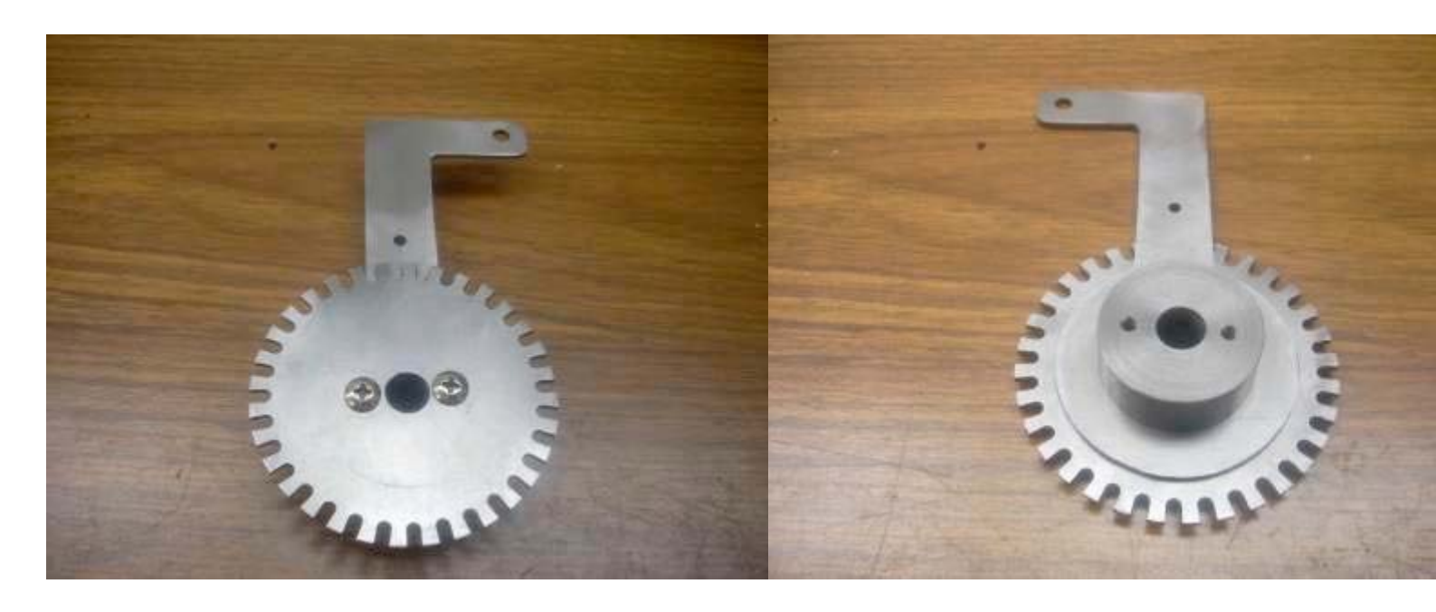
Added Ratchet Plate