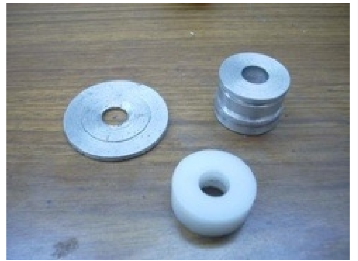
Early Attempts

I don't want to leave you with the impression that all went smoothly here. It took a few false tries to get the final product. My first try was with a 0.1" thick washer that contained a 0.05" high boss. This was going to be my pointer support, but it is not very useful. I plan to go with a simple steel pointer.