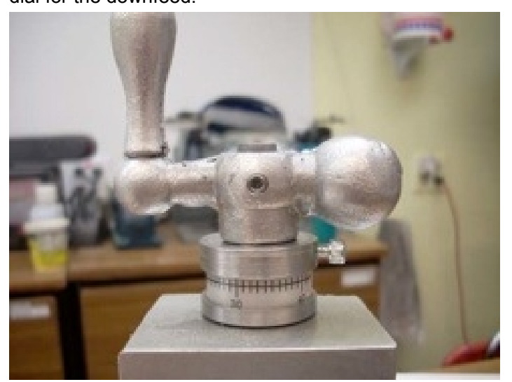
Down Feed Dial

I'm not much for engraving but wanted a nice looking dial for the downfeed.