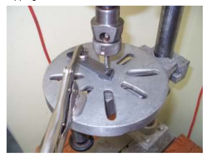
First Clamp Method

The bar is then tapped <sup>5</sup>/<sub>16</sub>"-18. I decided to hand tap the first hole but this got to be a chore. So I risked a real part using my "new" tapping head.