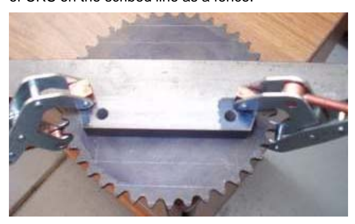
1st Bar Clamped

by eye is difficult. Instead I placed a straight length of CRS on the scribed line as a fence.