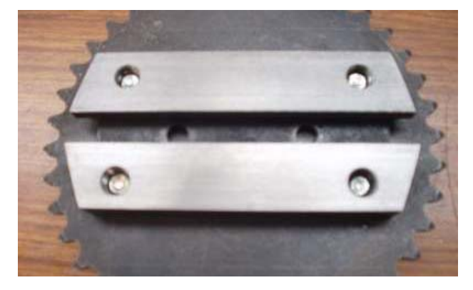
Both Bars Fastened

The second bar is pushed against the parallel and clamped in place. You can see the holes of the parallel in the gap.