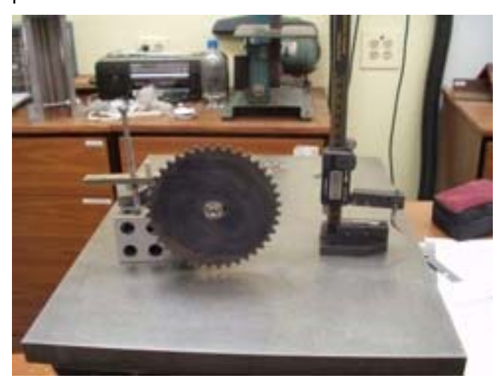
Scribing Sprocket

The placement of the crank plate is not critical but the spacing between the two halves should be precise. More on this later.