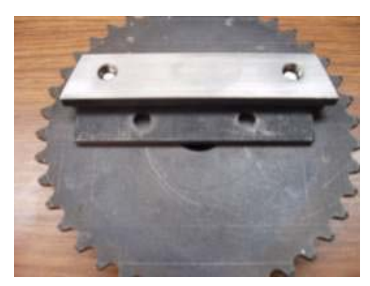
Bar plus Parallel

The bar is then secured to the sprocket using two grade 5 bolts and lock washers. The position of the second bar is more critical than this first bar. The gap between bars must be uniform. This is rather easy to do as long as it is not measured.