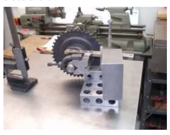
Laying Out Sprocket

After deburring, the bars were clamped in my mill vise and ^{1}/_{8} " x ^{1}/_{4} " lips were cut. My rough cut was 0.01" from the finished dimensions. I used a ^{5}/_{8} " end mill running at 770 RPM with a feed rate of 1 inch per minute. A liquid cutting fluid kept things cool. Tap holes were drilled with an "F" drill in each bar and deburred with a countersink mounted in a brace and bit.