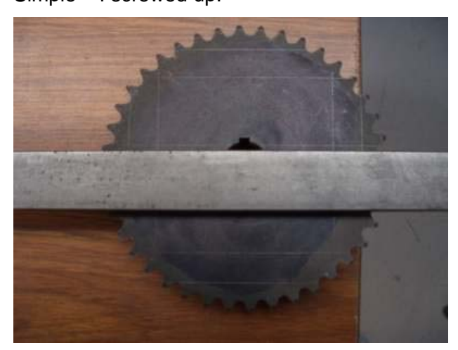
Using CRS as Fence

Here we have the scribed sprocket. You may ask why I scribed lines at \pm 2 " and \pm 1.5 " parallel to the ones needed to set the bars. Simple – I screwed up.