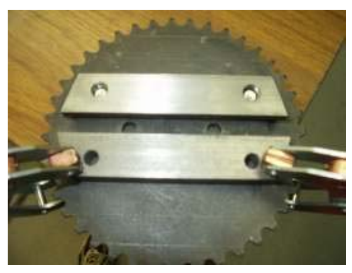
2nd Bar against Parallel Sparber