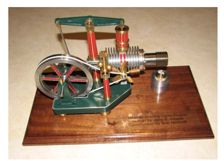
Bob Neidorff's latest creation!