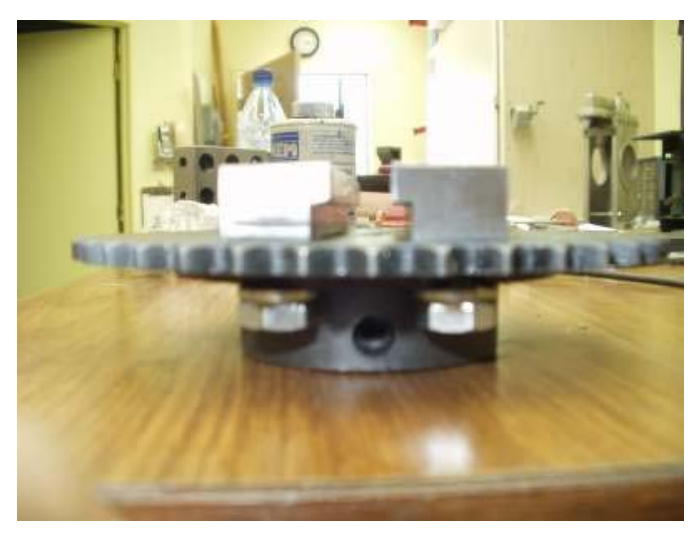
Sprocket Edge View

The attachment steps are repeated and the second bar screwed into place. As a final alignment step, all 4 screws are loosened and the parallel placed in the slot. Using my vise to apply gentle pressure on the bars and therefore on the parallel, I tightened all four bolts. My gap is now a precise \frac{5}{8} wide and parallel.