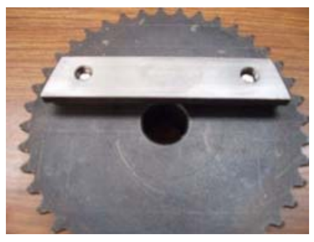
1st Bar on Sprocket

Some people may have told you that you can't break a tap in a tapping head. It can be done and is not pretty.