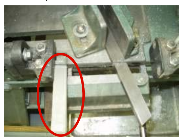
Cutting Bars

My first step was to cut the bars. Their overall length does not have to be precise so I just scribed lines and cut close. Clean up was done on my belt sander.