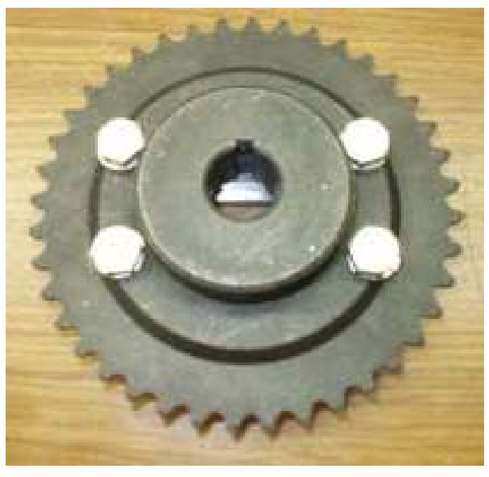
Sprocket Bottom View

Stay Tuned for part 13 from R. G. Sparber next month.