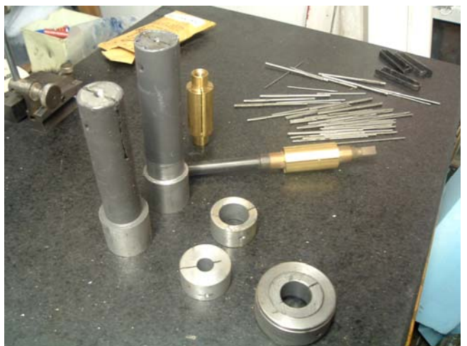
A collection of some lapping tools I made and acquired since Rollie's first talk on the subject.

It is very important not to confuse the rigid laps with the spring-loaded "hones" that can be found in auto supply stores. The spring-loaded types or "glaze-breakers" will follow, not correct, a tapered cylinder and can bell-mouth the ends of the cylinders. Rigid laps like those made by Rollie will correct a tapered bore or shaft. These very simple and inexpensive tools can yield the same results of very expensive grinders and honing equipment and can make up for a worn lathe as well.