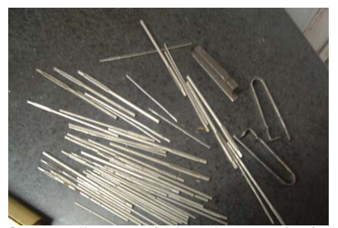
Some small commercial laps that range in size from .045" to .187" diameter. Handy for sizing small bearings. The steel clamps to the right are used to wedge open the splits in the laps.