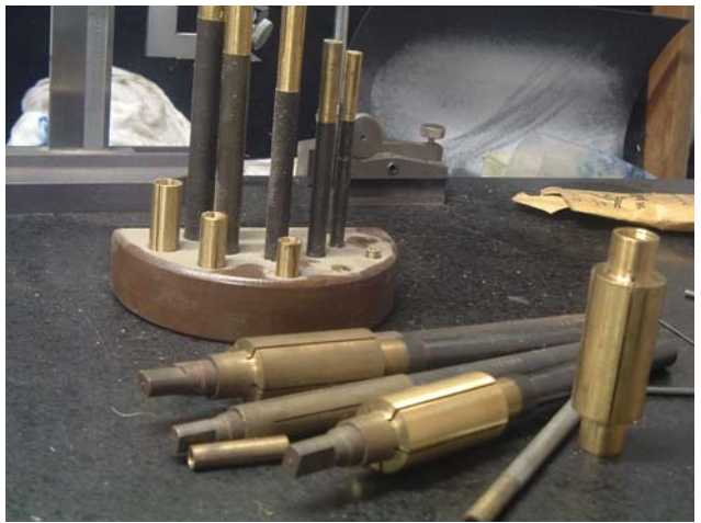
Some commercial brass flex laps. A setscrew in the end of the arbors expands the brass sleeve. These come in nominal sizes but also can be turned to whatever size is needed.