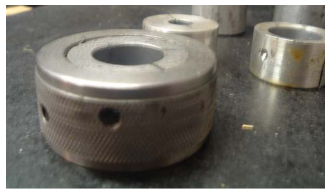
Aluminum split laps for lapping outside diameters and the holder that clamps them closed as they wear.