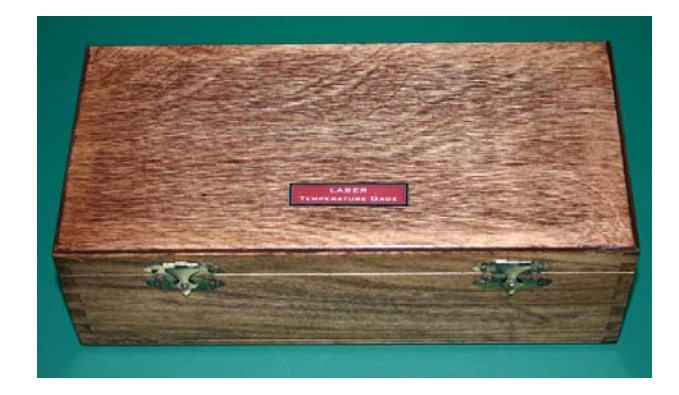
Wooden Instrument Storage Box

This little project was to keep me indoors and out of the rain. It didn't happen that way. My table saw is outside, under a circus-tent like car shelter. This is not recommended. Had the slab been damp, I could have electrocuted. Not a pleasant thought!